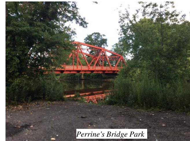
Perrine's Bridge Park

More information about the project is available at: http://www.esopus.com/lwrp-update/