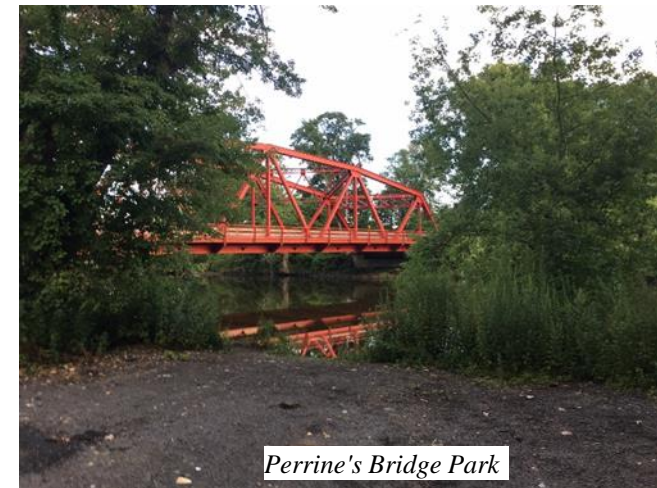
Perrine's Bridge Park

More information about the project is available at: http://www.esopus.com/lwrp-update/