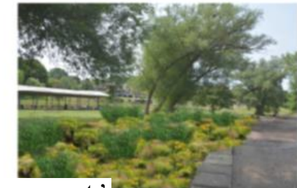
Shoreline Concept Rendering